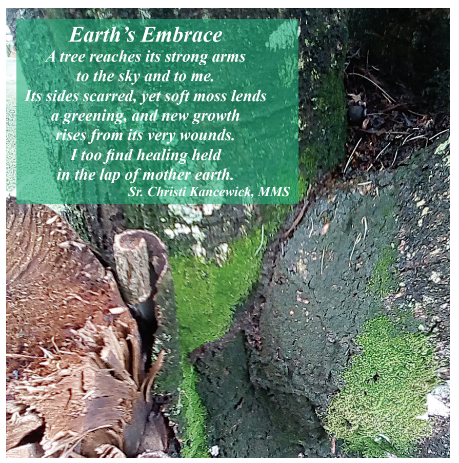
Medical Mission Sisters is an international religious community of Catholic women who commit ourselves to promote healing and wholeness in all aspects of life. Founded in 1925, our Sisters and Associates continue our healing mission in 17 countries on five continents.

Medical Mission Sisters 8400 Pine Road Philadelphia, PA 19111 215.742.6100 www.medicalmissionsisters.org