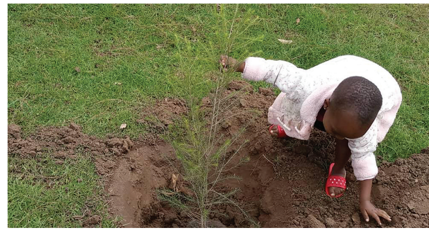
A child plants a tree at the MMS health center in Rubanda, Uganda.